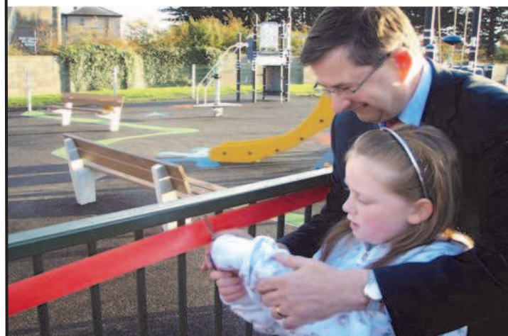
Minister Eamonn Ó Cuív and Laura Redmond open PlayZone in Convent Lawns 10th November 2008

Convent Lawns and Bridgeview benefitted from the RAPID Programme with new playgrounds in each area. Dublin City Councils came up trumps with additional funding for both playgrounds including security railings. PlayZone is the Convent Lawns Playground and Happy Days is the Bridgeview Playground. The children of each area named their playgrounds and the RAPID Programme is very proud of the work accomplished. The playgrounds were designed and installed by GoPlay with the funding from the HSE RAPID Leverage Fund. The playgrounds provide a safe secure environment in which children can play. The equipment comprises of solo play items, group play items and items designed for children with disabilities and have passed the most stringent safety guidelines.