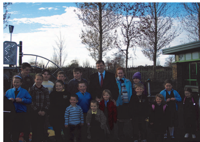
Minister Ó Cuív meets the children of Bridgeview and St Olivers 10th November 2008